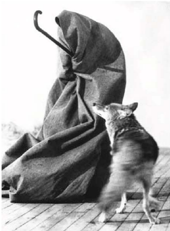
Image: Beuys wrapped in felt blanket to appear like a Native American tipi and the staff to represent a lightning stike or a shaman mask depicted in a Native American tale. Photographer: Caroline Tisdall London, 2005, . Source: www.tate.org.uk/modern/exhibitions/beuys/