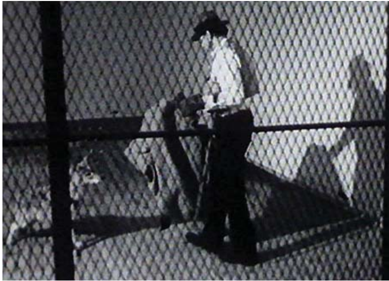
Image: Beuys entering room with Coyote, felt blanket and shepards staff, .

authors / actors / participants: Joseph Beuys, (Fluxus) coyote,