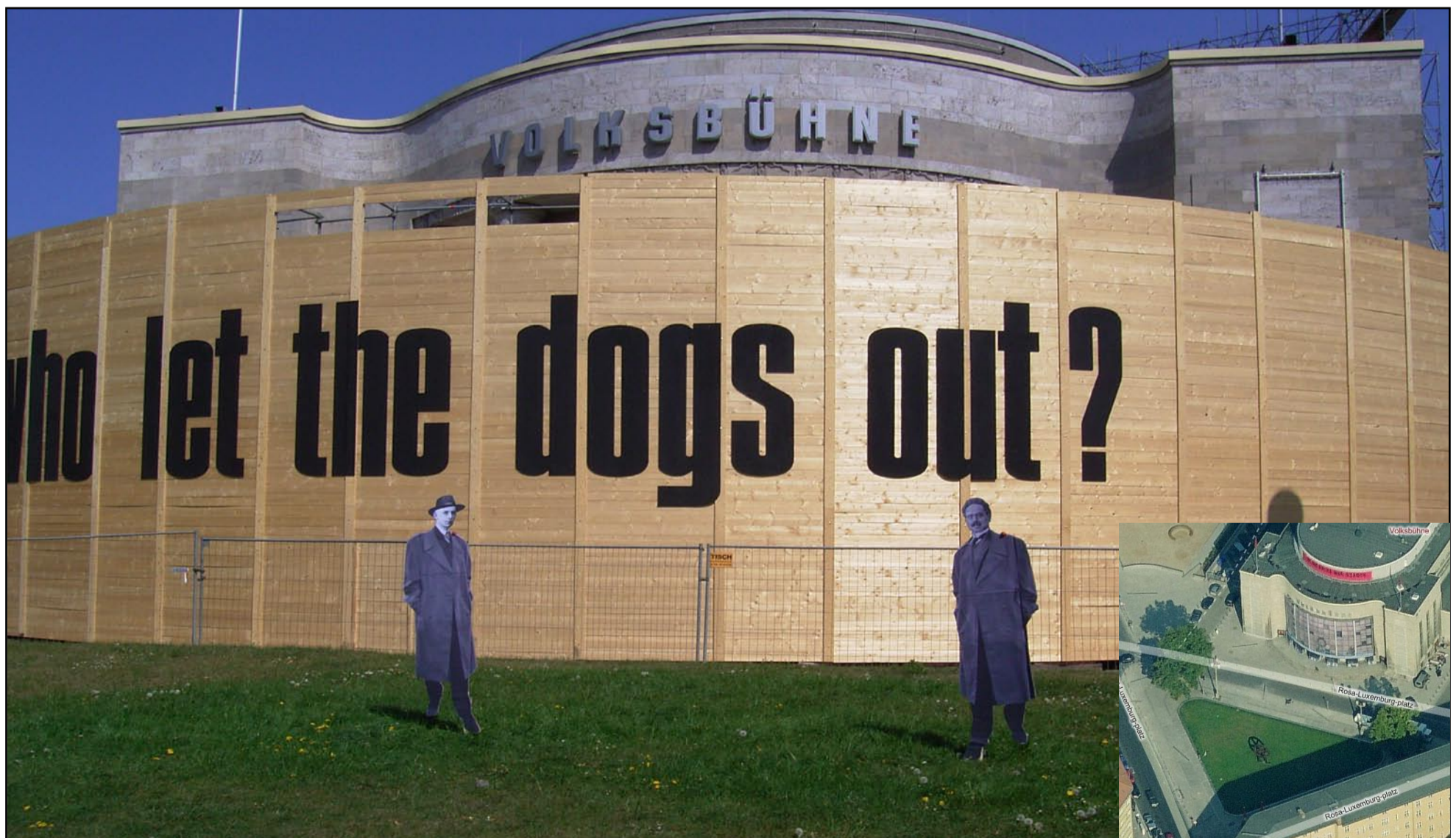
Image: Triangle-formed lawn in front of the Volksbühne, on Rosa-Luxemburg-Platz, Berlin.