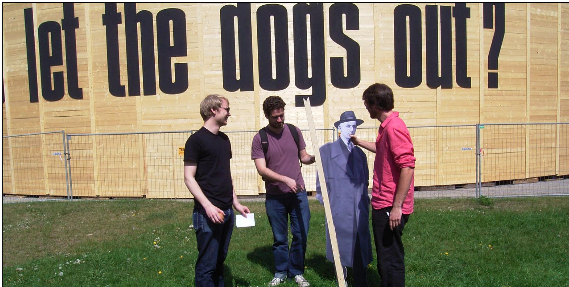
Image: 3 visitors after having successfully shot the bad guy - What to do with him now? Note the murder weapon in the blond man's hand.