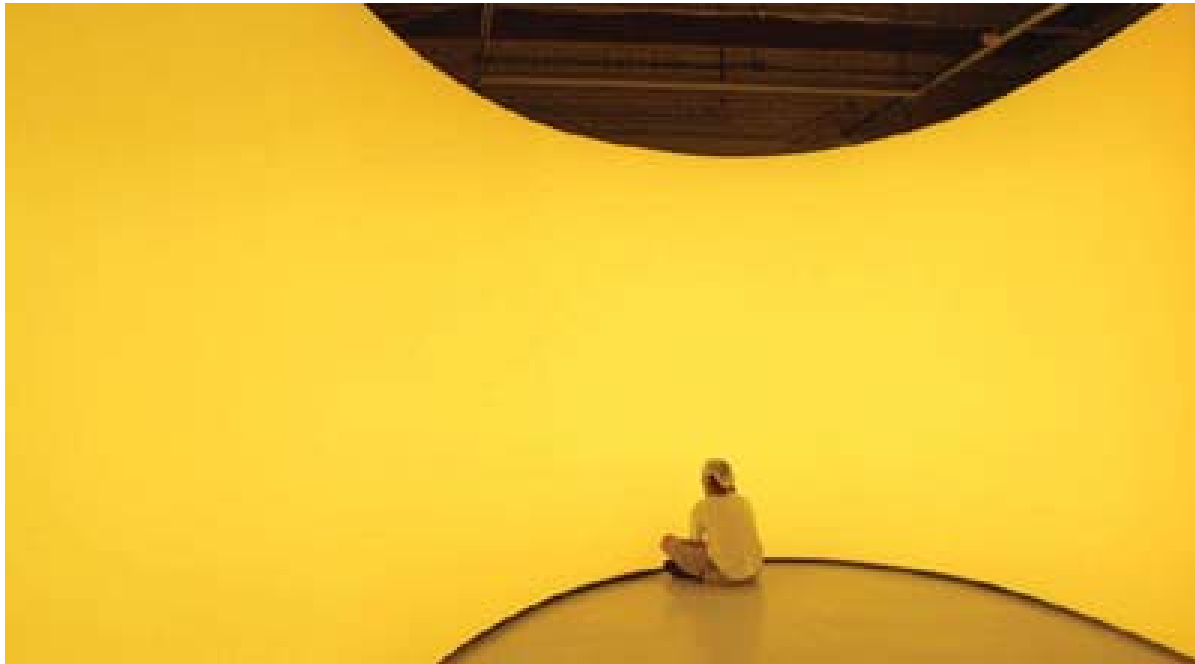
Image: Viewer sitting in Your Colour Memory .

authors / actors / participants: Olafur Eliasson, installation piece, viewers.