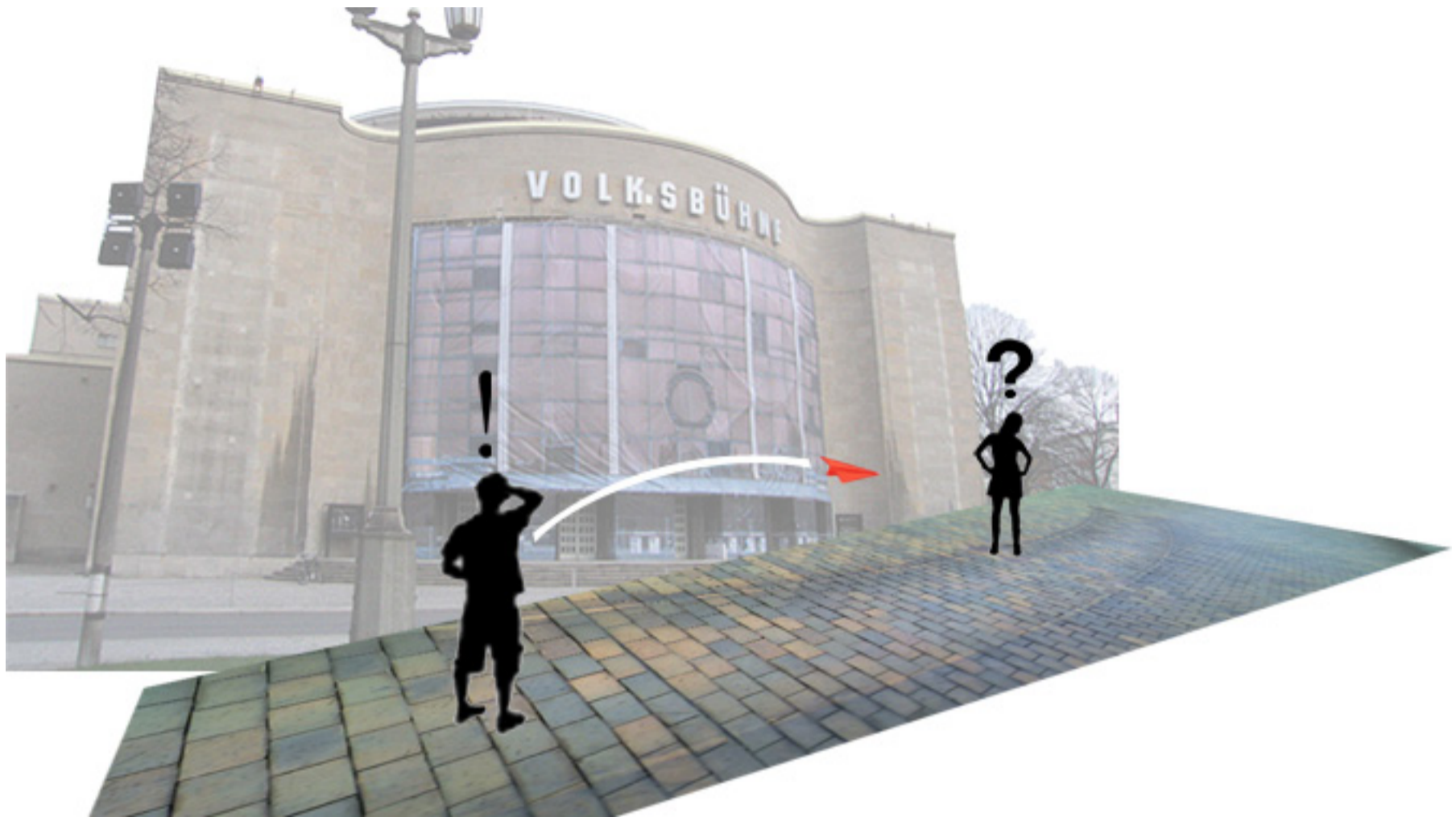
sketch: Diagrammatical Photomontage indicating the action of throwing paper aeroplanes at a member of the public.