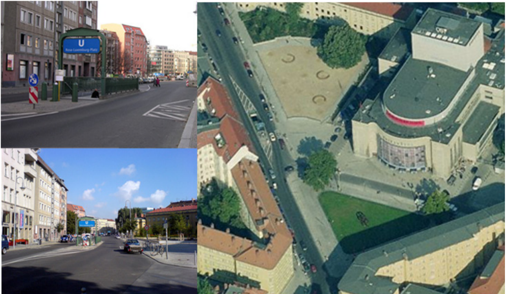
Image: Rosa-Luxemburg-Platz location.